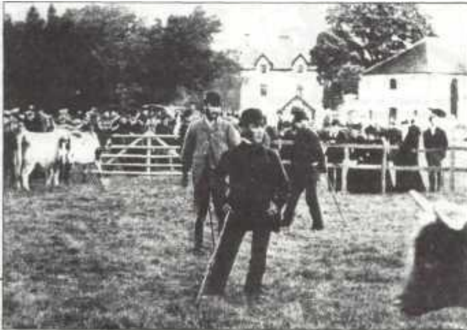
"JUDGES IN THE RING" - KILLIN SHOW, 1880.

Construction of the Sports Pavilion and tennis courts is now well advanced and should be complete towards the end of 1991. It is regretted that the tennis courts which were scheduled to be ready by 31st July are still under construction. The enthusiasm and support of the local community in various fund raising events must be commended. In recent weeks the Bowling Club held a Bric a Brac and raised £500, the Sports Club Committee ran a raffle for a video recorder and collected £106 and the Playgroup donated £90 following their efforts at the Killin Show. The Duck Race raised £291.