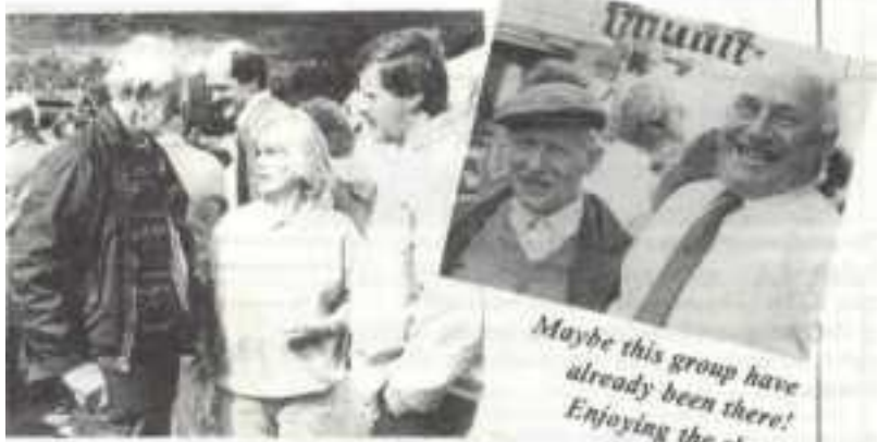
Some of the Killin News editorial committee debating whether to go back to the beer tent or not!

Maybe this group have already been there! Enjoying the show anyway.