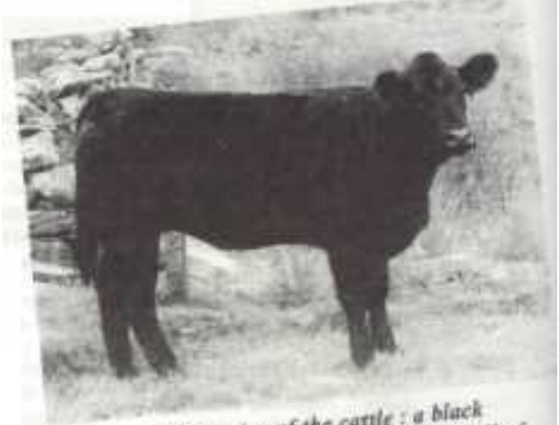
The overall champion of the cattle : a black Limousin cross heifer owned by A. Campbell of Balnasuim.