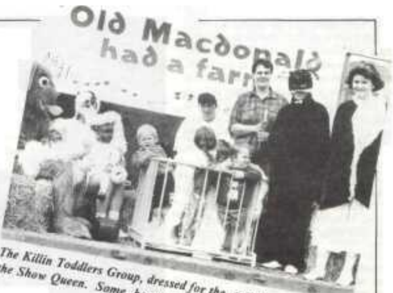
The Killin Toddlers Group, dressed for the occasion, along with the Show Queen. Some bonny wee Black-faces!