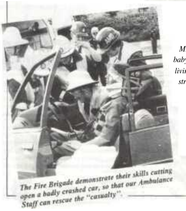
The Fire Brigade demonstrate their skills cutting open a badly crashed car, so that our Ambulance Staff can rescue the "casualty".