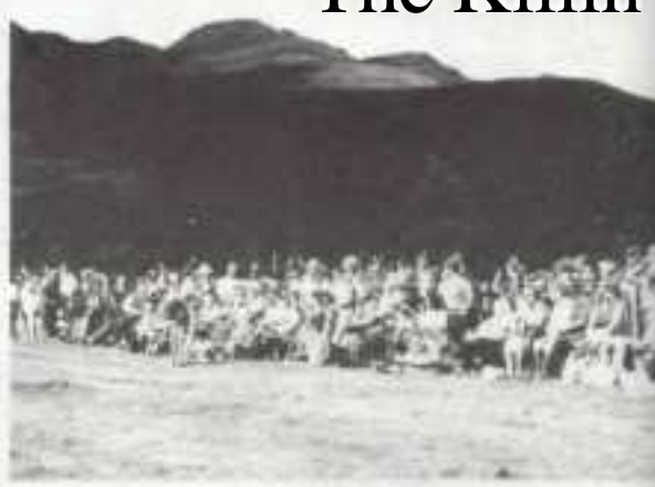
A good crowd on a good day with the