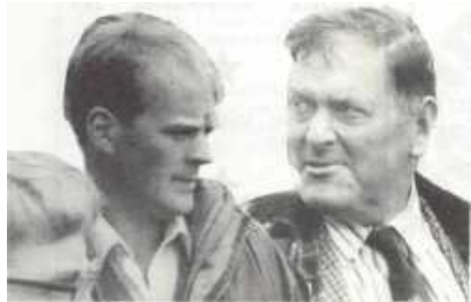
"Interested parties"! Two faces from the knowledgeable crowd who watched the sheep judging intently.

Maybe this group have already been there! Enjoying the show anyway.