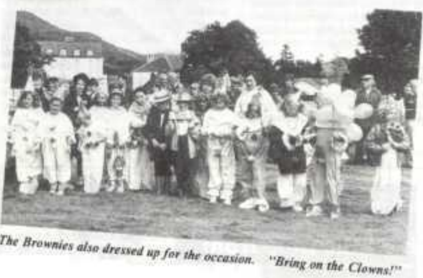
The Brownies also dressed up for the occasion. "Bring on the Clowns!"