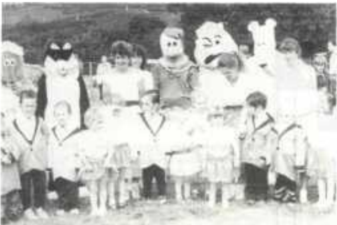
Playgroup! Why do the mothers have to disguise themselves?