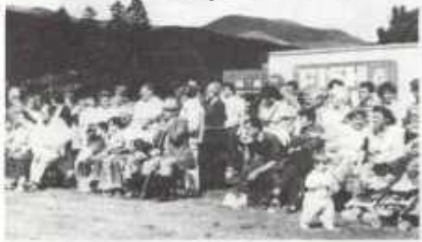
Tarmachan Ridge in the background.