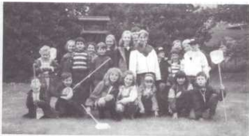
The Green Team will be walking for "Forests Of The World" on Sunday 4th October