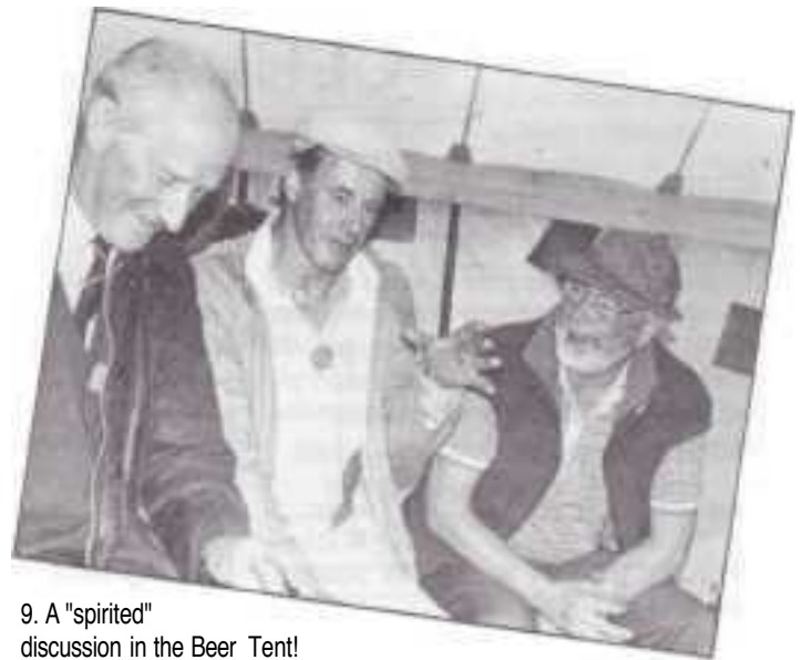
9. A "spirited" discussion in the Beer Tent!