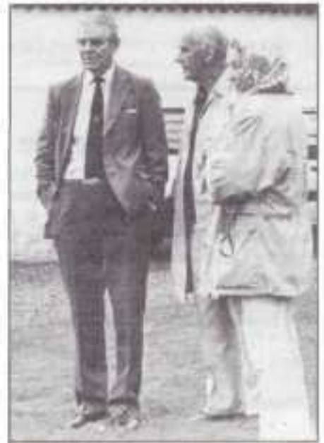
11. Wot! No prizes for us!