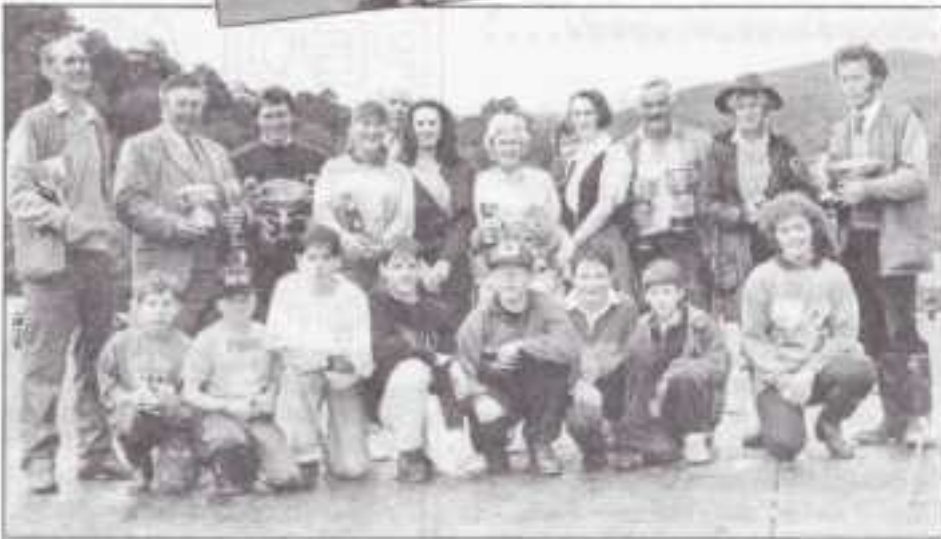
4. The prizewinners