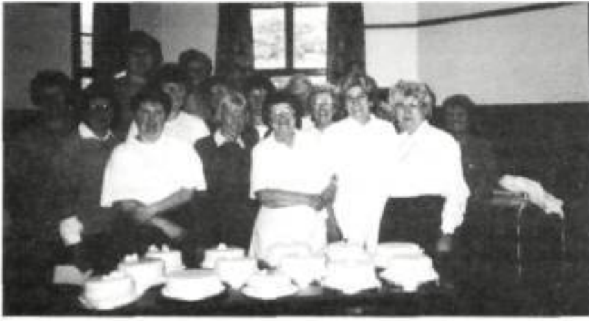
Eager Students on Summer School