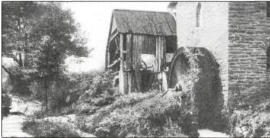
St. Fillan's Mill in its working days