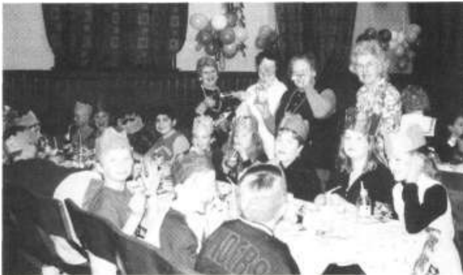
On December 16th the members of Killin WRI hosted the Annual Christmas Party in the McLaren Hall for pupils and staff of Killin Primary School.

WRI Ladies and their guests were entertained by the pupils who danced their way through the first part of the afternoon. After refreshments Primary 7 pupils aided by thespians bearing more than a slight resemblance to Killin Primary School Staff, rounded off the afternoon's entertainment with a "pantomime".