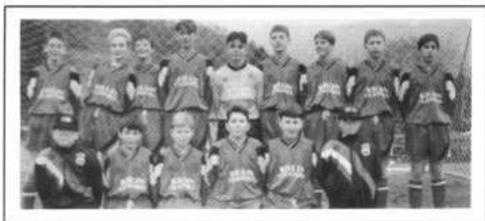
Junior Football Club in their new strips