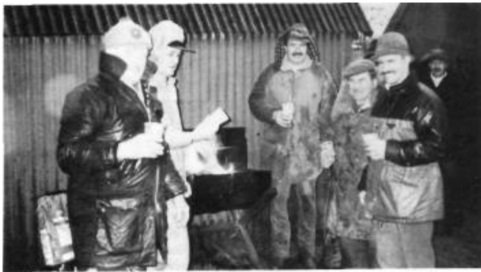
The dawn barbecue at Kinnell Boathouse