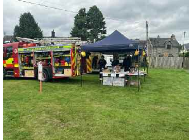
Firefighters with their display stand.