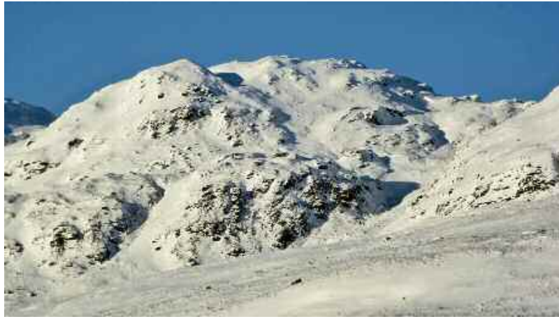
Beinn nan Eachan East Top, mysteriously deleted from Munro's Tables in 1981

March 1986. There were three of us. Nine months earlier we had struggled through deep snow in the Pyrenees and had to spend a night out high up under a boulder. Perhaps we thought we were ready for anything, but we had not given much thought to conditions in Scotland in the middle of March. I was 33 but infected with the enthusiasm of youth that I had never felt in my youth.