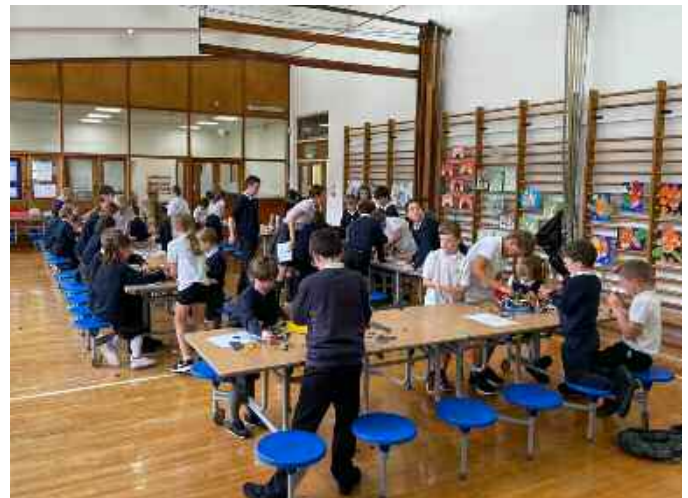
This term our House Captain Challenge was to work together to build a lego Taj Mahal!