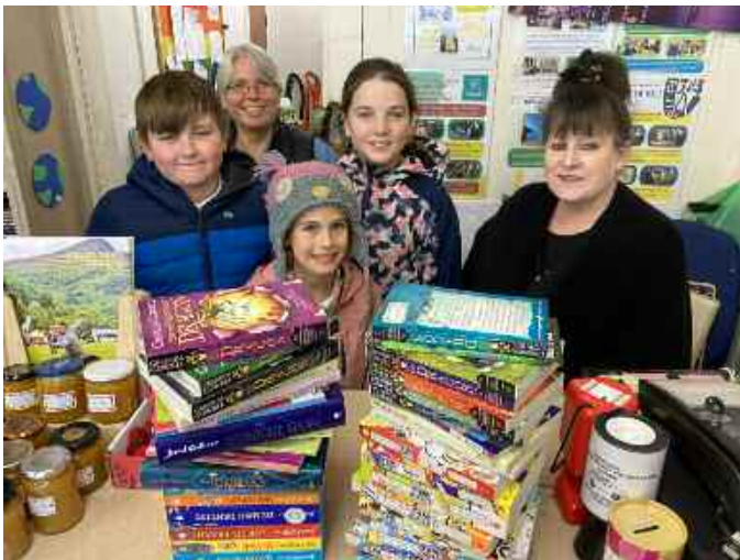
We managed to buy many wonderful books from the RecyKillin shop to add to our library!