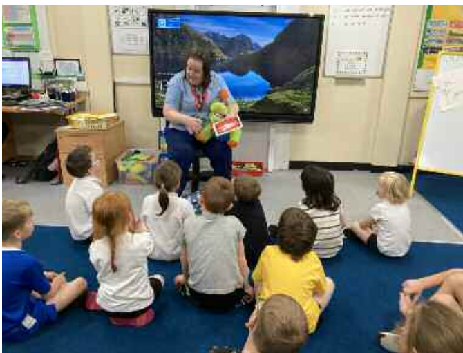
The dental nurse from Childsmile came to teach Class 1 how to look after their teeth by brushing twice a day and not eating too much sugar.