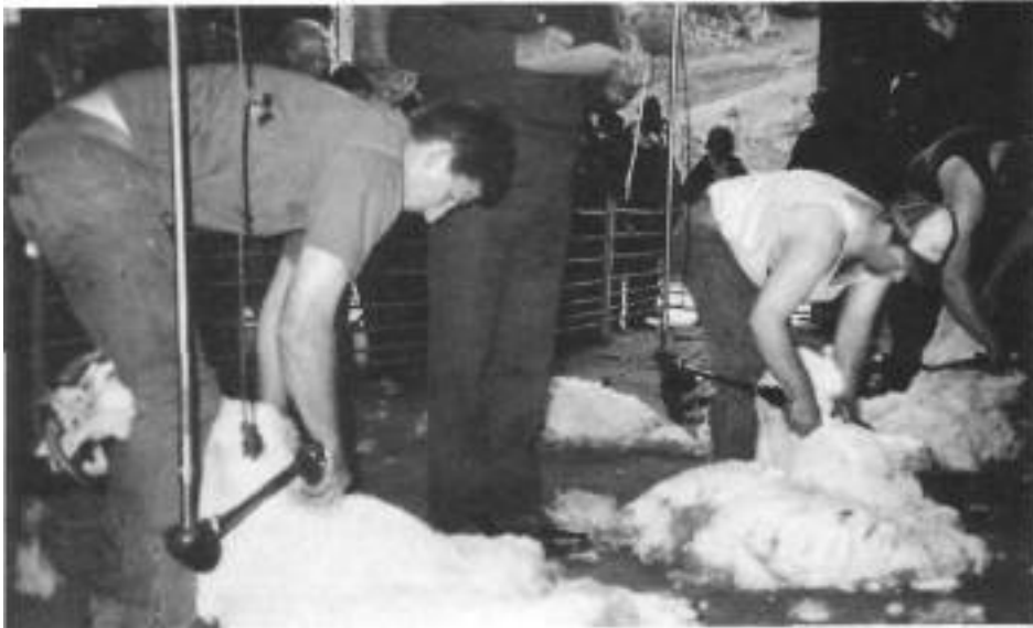
Shearers at Work: Innishewan