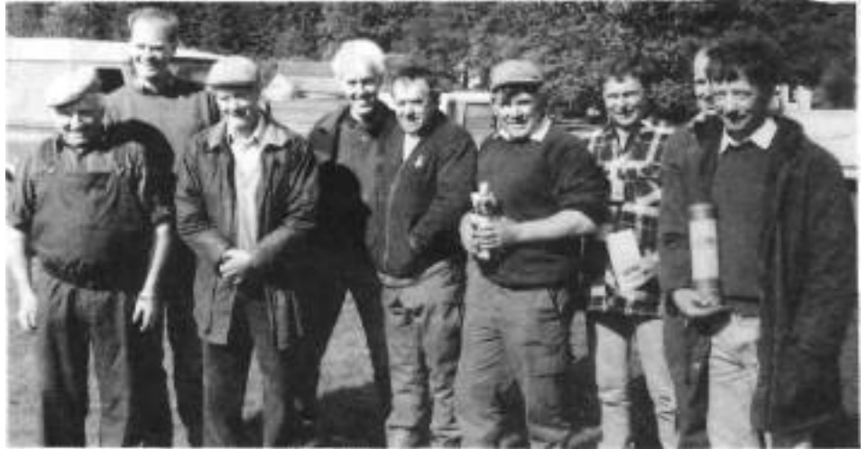
Prize winners and competitors