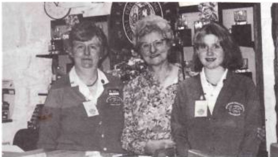
The staff of the new Tourist Information Centre on the ground floor.