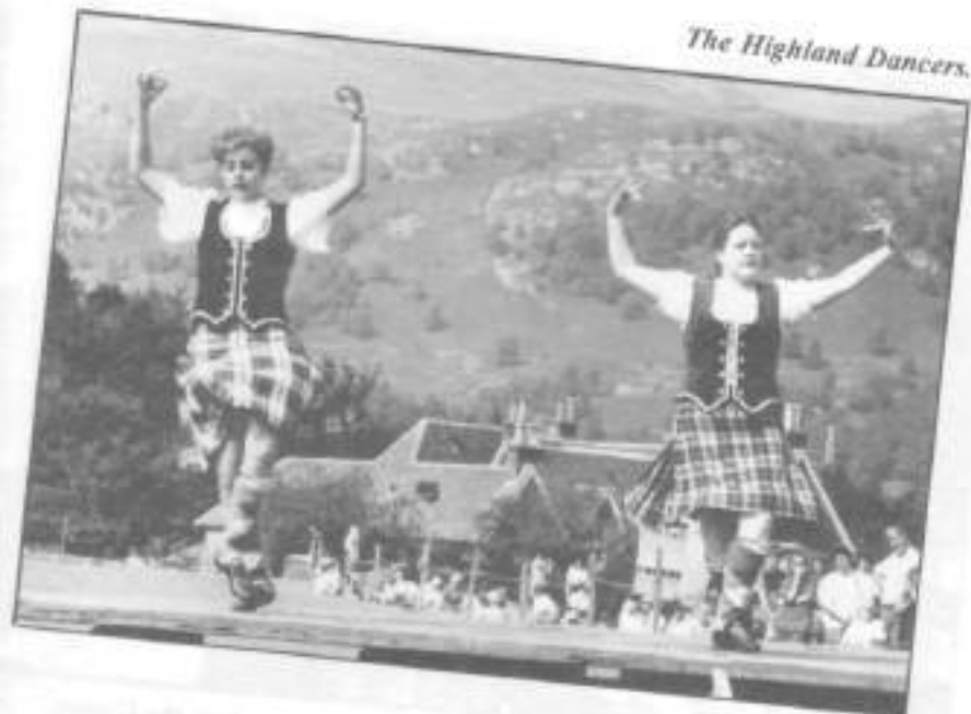
The Highland Dancers.