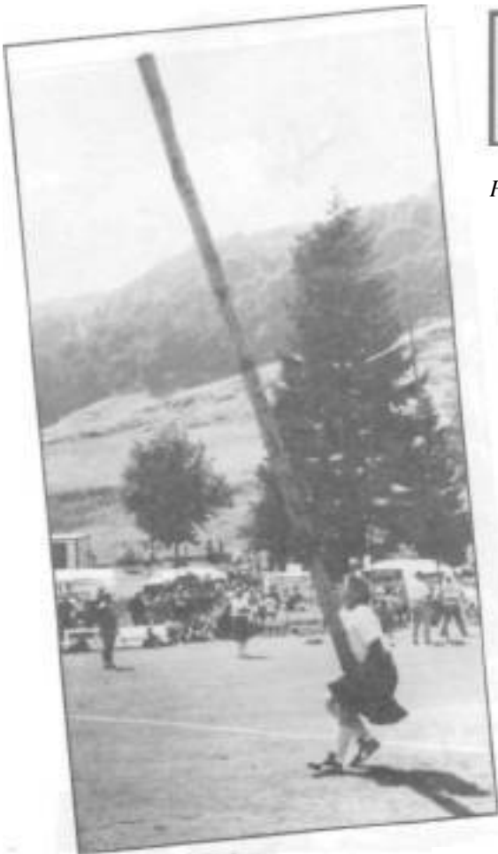
Tossing the Caber