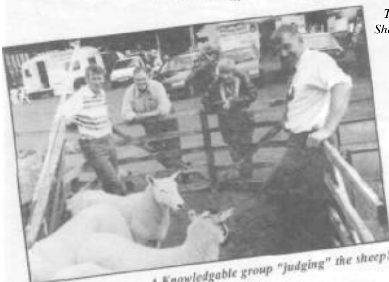
A Knowledgeable group "judging" the sheep!