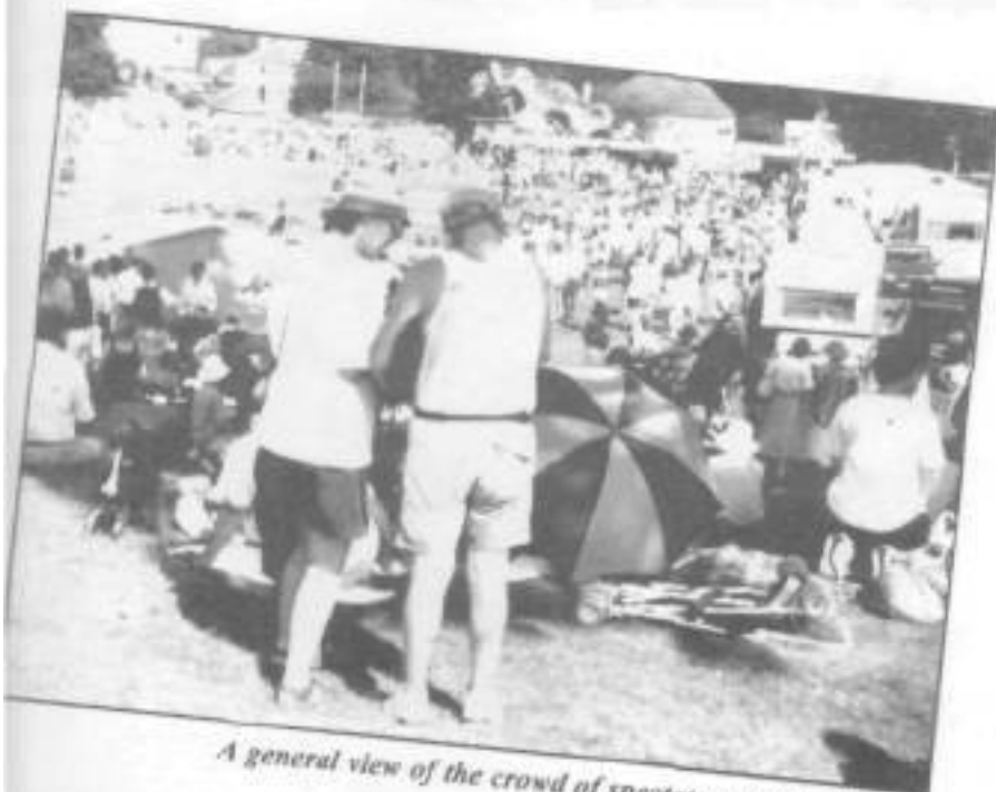
A general view of the crowd of spectators filling the park