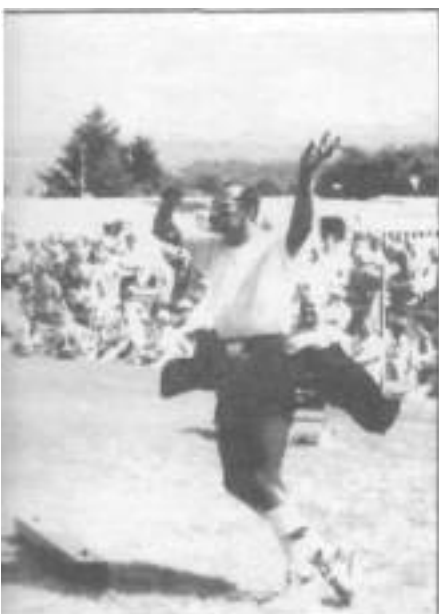
Throwing the hammer