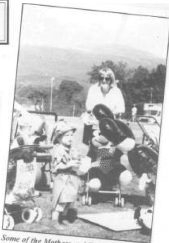
Some of the Mothers and Toddlers Group dressed up for the Show!