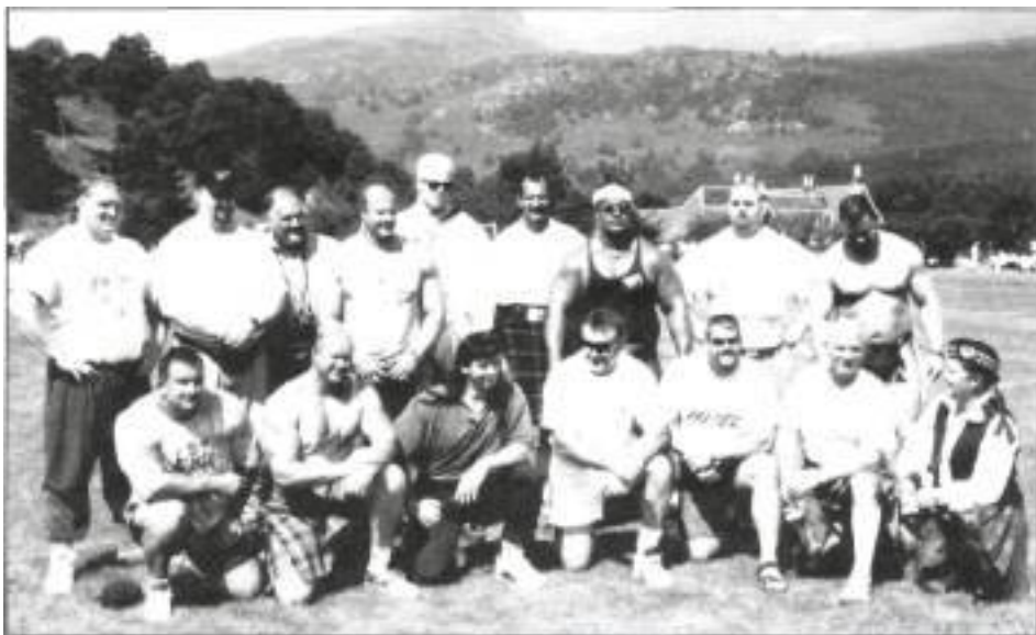
The World Famous "Strong Men" who competed at the Games.

So the Games took place again and again with the same "threat" from the weather! Only this time the weather "problem", was too much sunshine . Some of us thought that the strong men would collapse in the extremely high temperatures, but were happy to say they didn't; in fact they performed as well, if not better than last year, much to the delight of the 3,000 people who basked in the sunshine and thoroughly enjoyed the day.