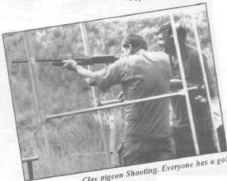
Clay pigeon Shooting. Everyone has a go!