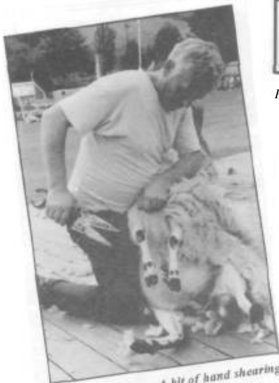
A bit of hand shearing.