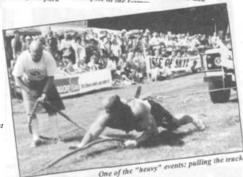
One of the "heavy" events: pulling the truck.