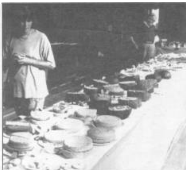
Competing for the baking prizes, some of the produce.