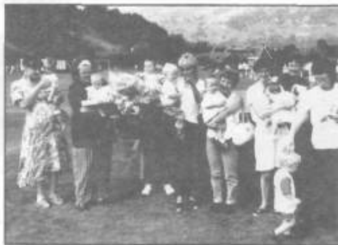
"Competitors" getting ready for the "Bonniest baby" Comp