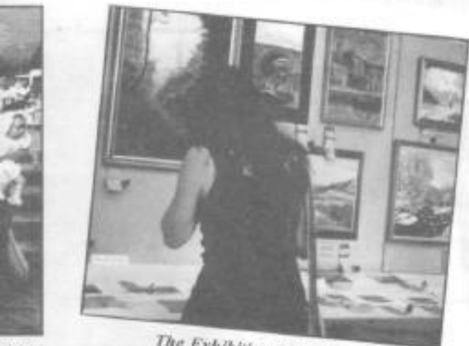
The Exhibition of local artists' work.