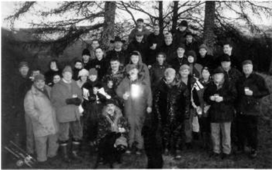
The "Gang " at Auchmore before setting out.