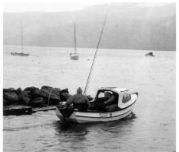
A wee boat in a big loch!