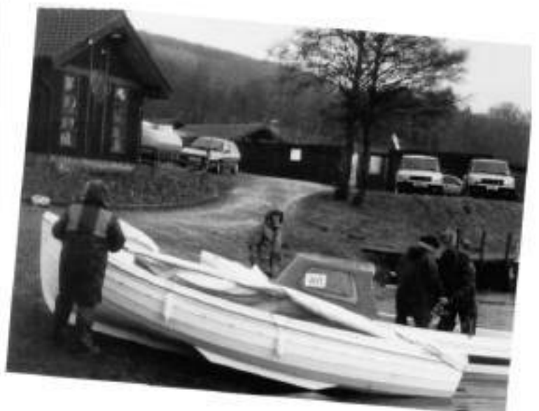
Last minute preparations at Morenish.