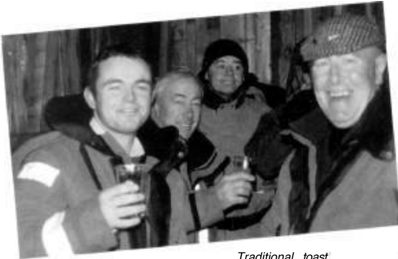
Traditional toast Tight Lines!