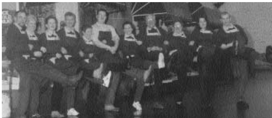
On a dismal grey day, the staff at MacGregor's brighten up Main Street.