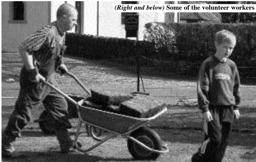
(Right and below) Some of the volunteer workers