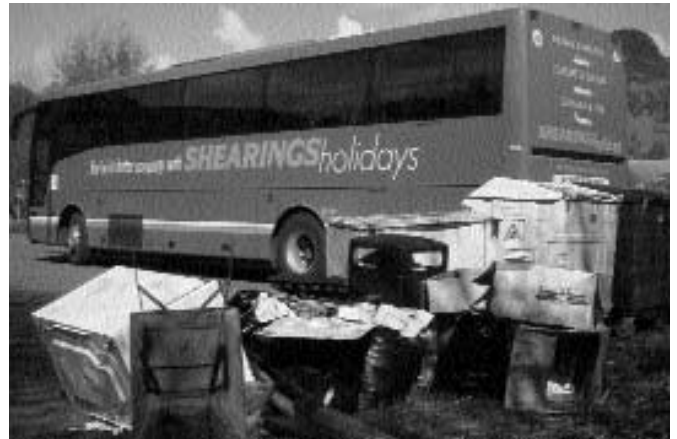
The photo shows the sight which greets our visitors to Killin!

The disgraceful dumping of household waste when there obviously was no skip to put it in. Note the burst car battery leaking acid in the centre of the photo. This was the one item which Stirling Council and Killin Community Council, through the pages of the Killin News, stressed must not be dumped. Apart from jeopardising the skip situation, it is also very dangerous – especially in this area where people, children and dogs are often walking.