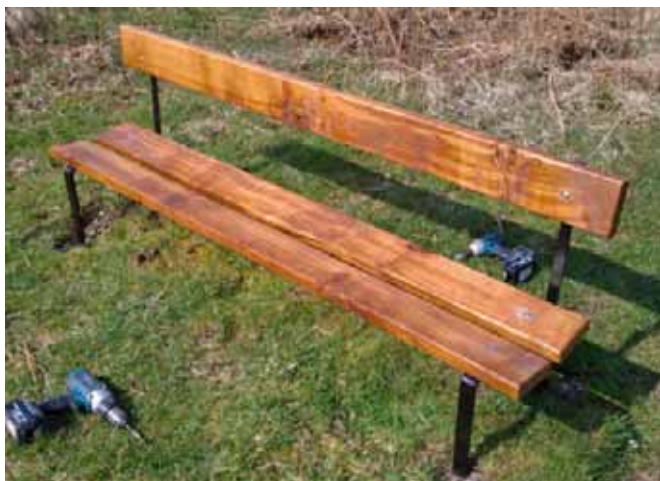
Three benches on the Auchlyne road have been refurbished with funding from the National Park.