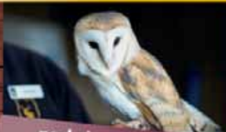
red deer centre

From the shelter of the Red Deer Barn, stroke, feed and photograph these magnificent, iconic animals and meet Ossian the Barn Owl with a knowledgeable Safari Ranger.