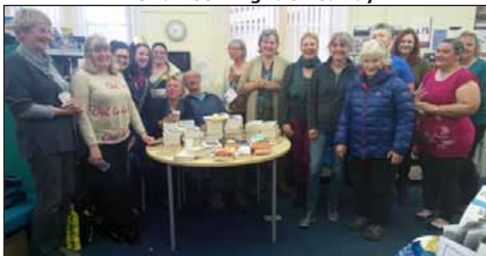
On World Book Night the Third Chapter Book Club organised a World Book Giveaway event at Killin Library.