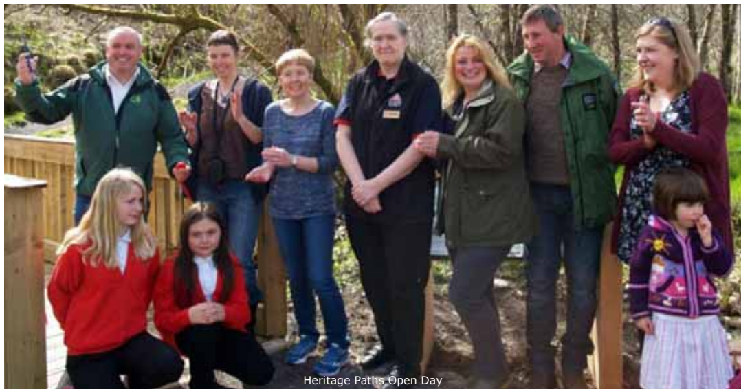
Heritage Paths Open Day

Dates for your Diary: Tai Chi – Tyndrum Village Hall,