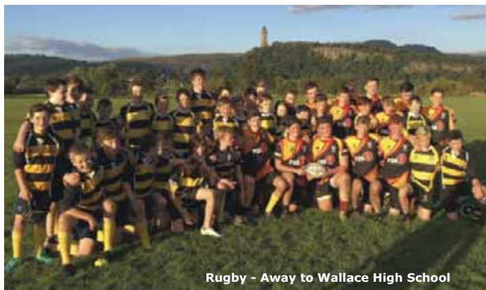
Rugby - Away to Wallace High School

In a tough match, the U16 team came up against a well organised Wallace team who ran out well deserved 73-38 winners. McLaren never gave up and kept playing until the final whistle. Well done to all the boys for their efforts over the past six weeks to help make it a positive start for the newly formed McLaren Rugby.