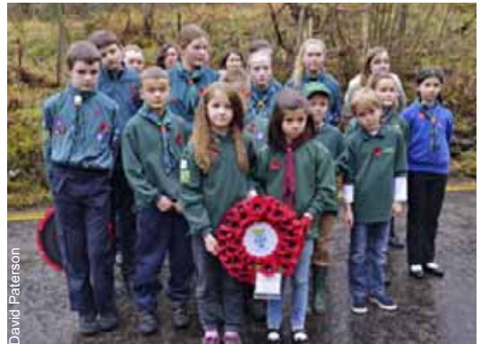
Young and old pay their respects to the fallen