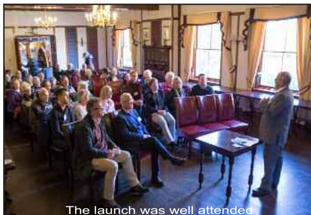
The launch was well attended