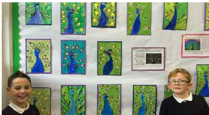
Incredible India - Class 3