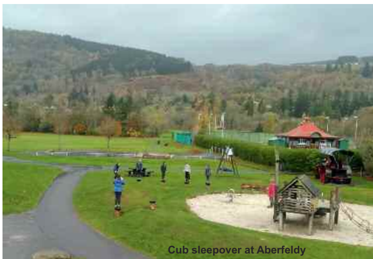
Cub sleepover at Aberfeldy

It has felt like we have had a lot of fires this term with at least two outside in the park, one of which we even attempted to cook on! Not a real success but certainly all the Cubs are excited to try it again, maybe slightly bigger and better. A highlight of the term was to have an overnight sleepover at the Aberfeldy Scout Hut. This was a great way to finish off a load of badges and have fun at the