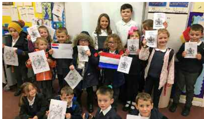
Around the World