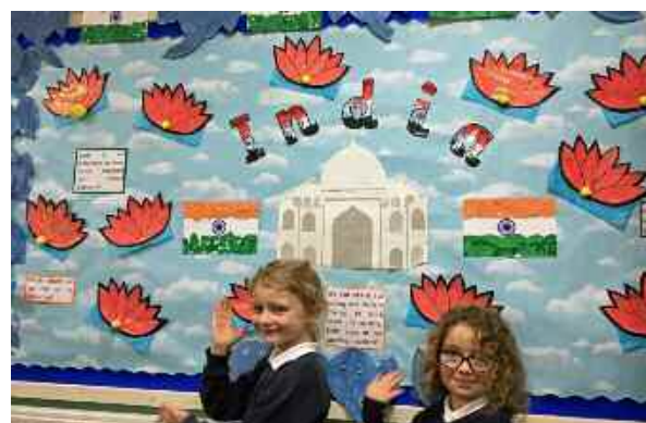
Incredible India - Class 1