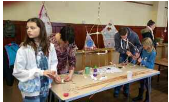
Some pictures from last year's lantern making workshop

This FREE of charge workshop is Sponsored by : Tayfitness/ Stirling Council/ Killin Co-op/ Killin Masonic