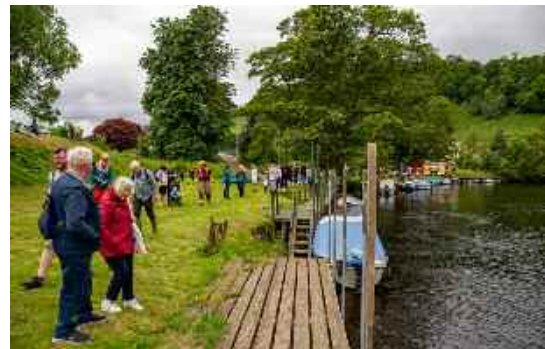
Crowds wait at the finish line - did I win ?