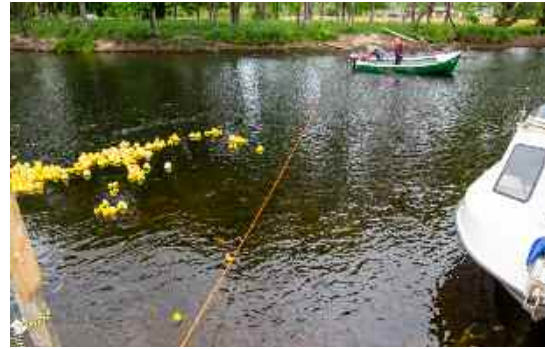
They're lined up ready to go