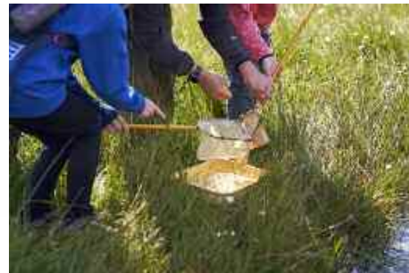
A bird's eye view