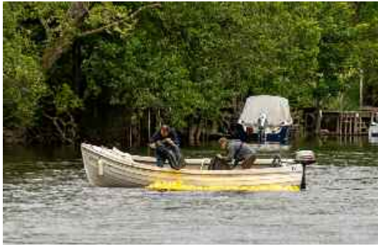
The ducks enter the water

The annual Duck Race took place on Saturday 22nd June