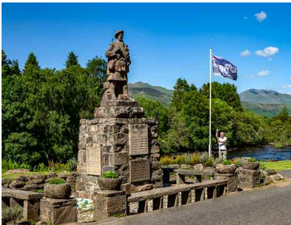
The D-Day flag was raised at the village war memorial at the start of June to recognise and remember the anniversary of this event