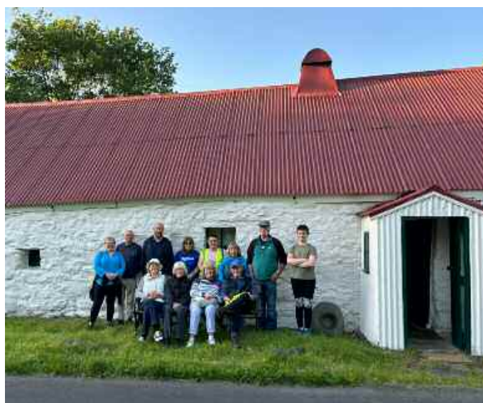
Evening walk to Moirlanich

More details can be found at our website www.trustinthepark.org