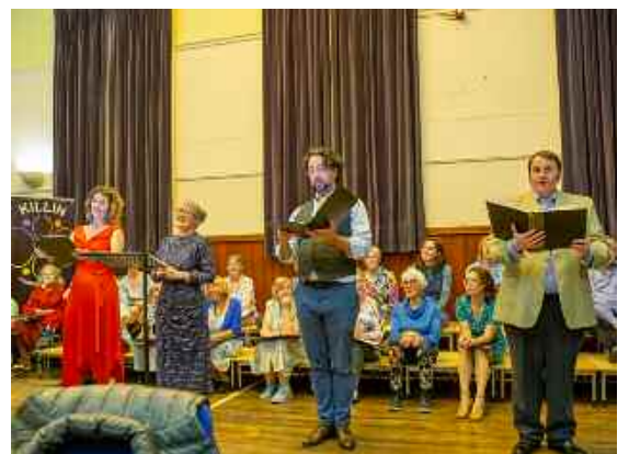
Pictures from the Killin Community Choir Concert held on 8th June at the McLaren Hall.