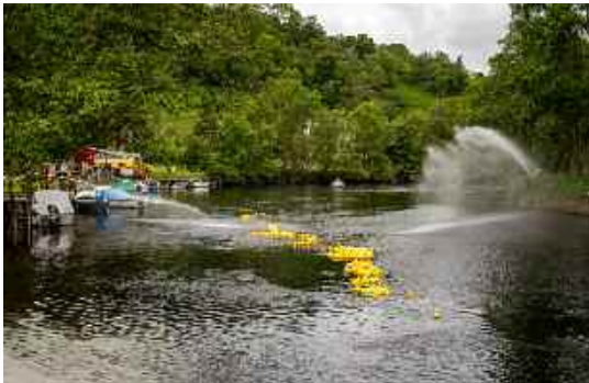
Helped on their way by the fire brigade