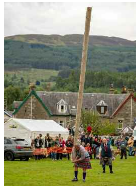
Some pictures from last year's Highland Games